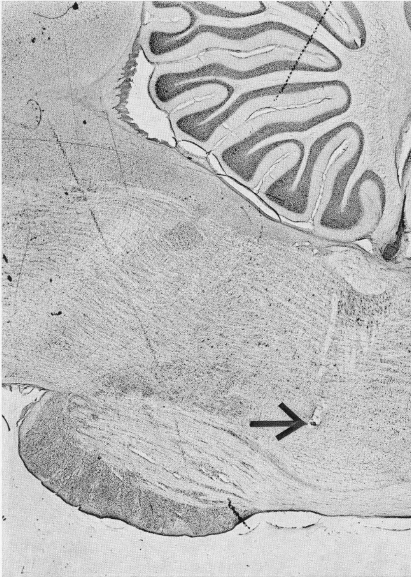
Fig. 3. Electrode track whose termination (arrow) is at point at which pinna movement cell was recorded.

were histologically localized to the facial nerve. The 3 units that are mapped at the level of the genu were in the nucleus praepositus hypoglossi on electrode tracts that did not penetrate the genu. However, because a few of the units were near the facial nerve, we analyzed the spike waveform of all cells to see if the waveshapes were consistent with the units being stray facial nerve axons. Spikes were initially negative in 9 cells and initially positive in 10. Signal to noise ratio was generally higher than that recorded in adjacent non-pinna movement cells, ranging from 3/1 to 15/1. Spike am-