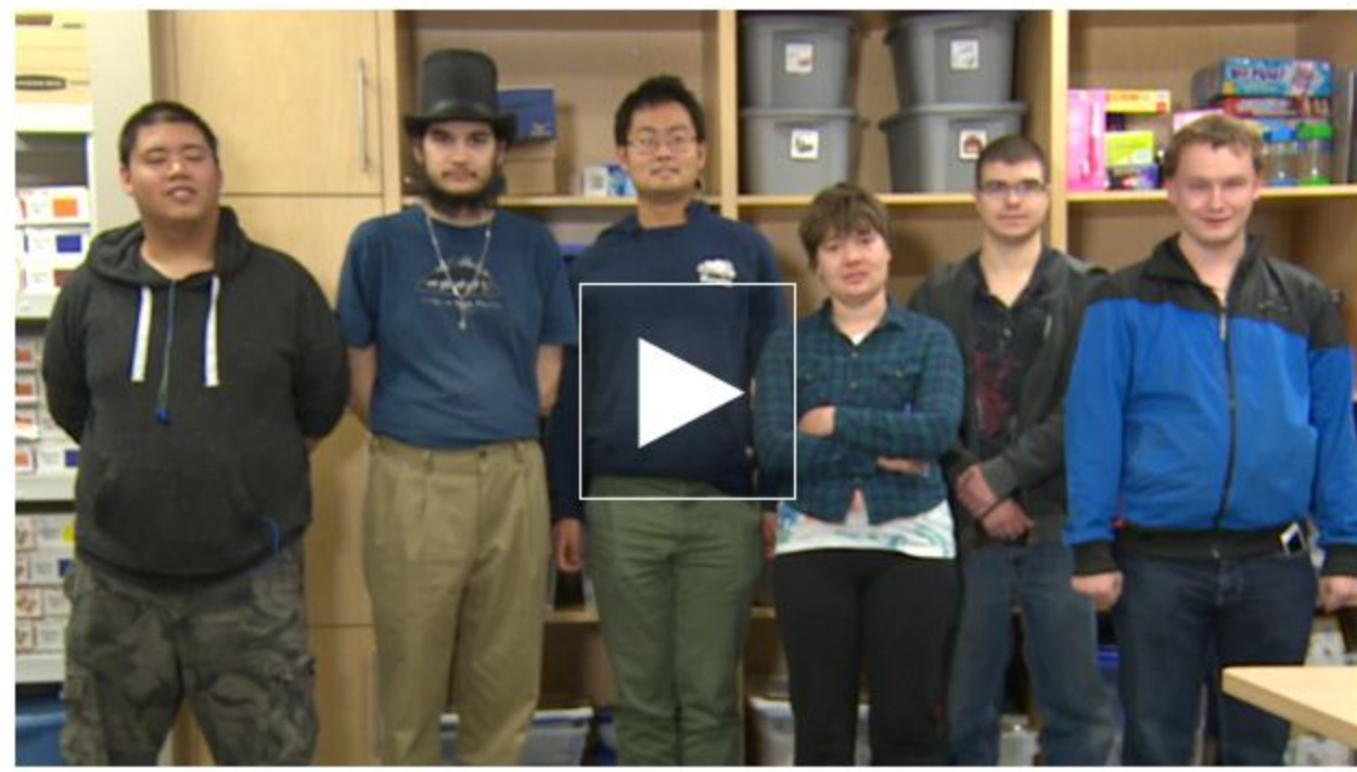
Dating advice for adults with autism 10:12

A program in Calgary is helping adults with autism learn social skills to navigate the world of dating.