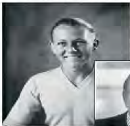
Art Linkletter July 17, 1912 - May 26, 2010

T he ICON award honors individuals who have made outstanding contributions to society through their lives while exemplifying the center's motto, "living better longer."