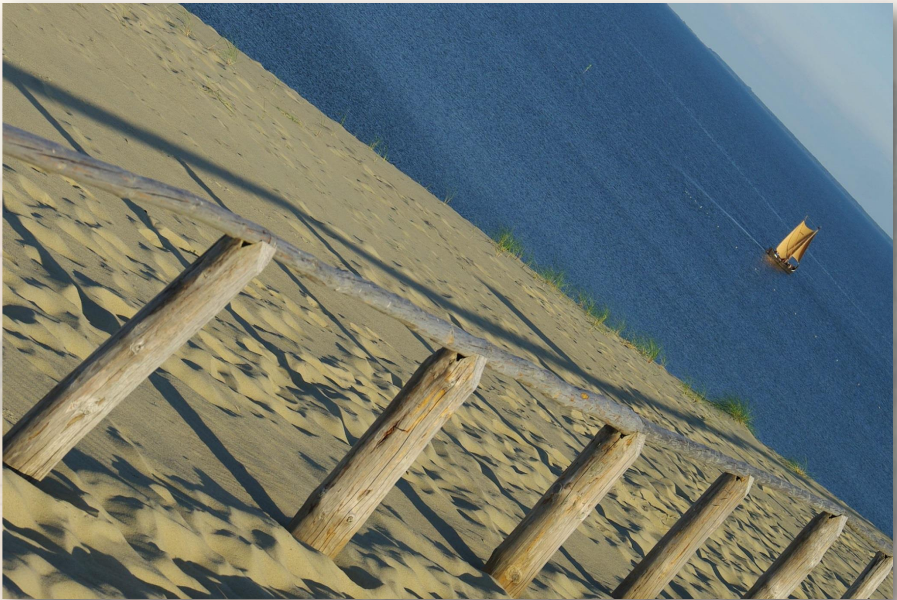
Curonian Spit near the Baltic Sea