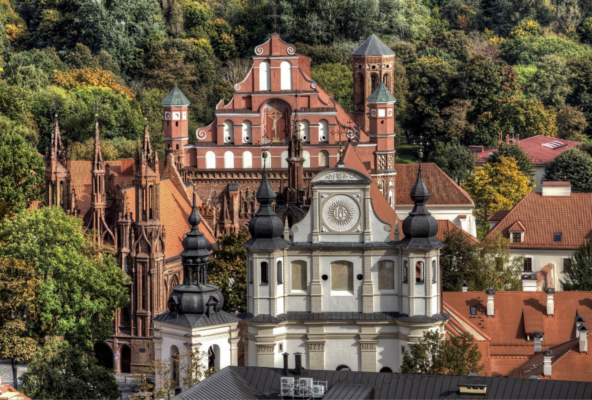
Vilnius Old Town