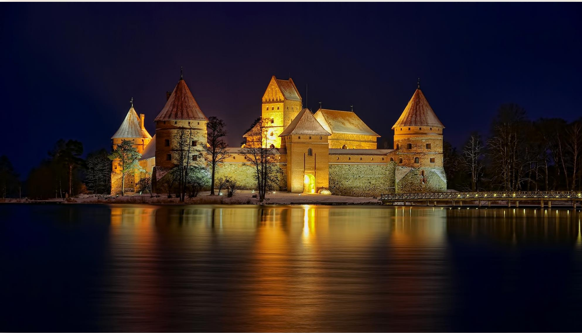
Trakai Island Castle – early residence of the Lithuanian grand dukes