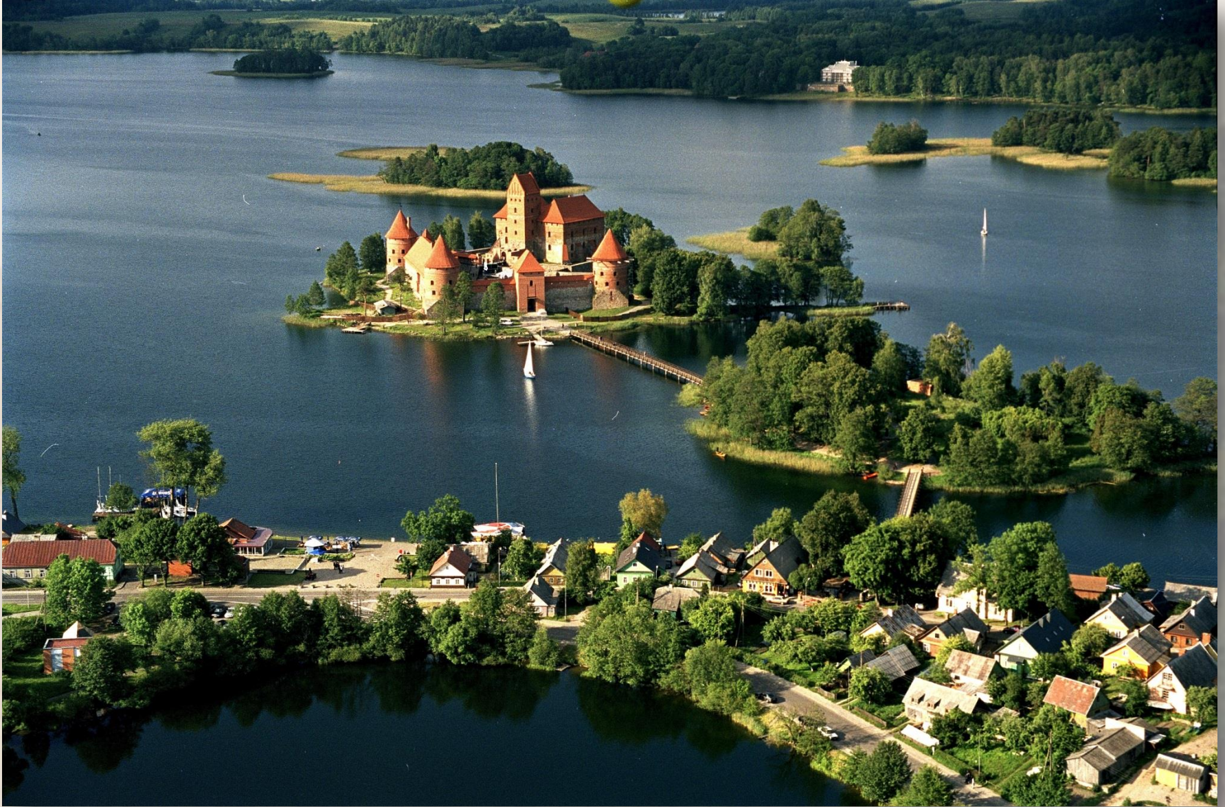
Trakai - a cradle of Lithuanian Statehood