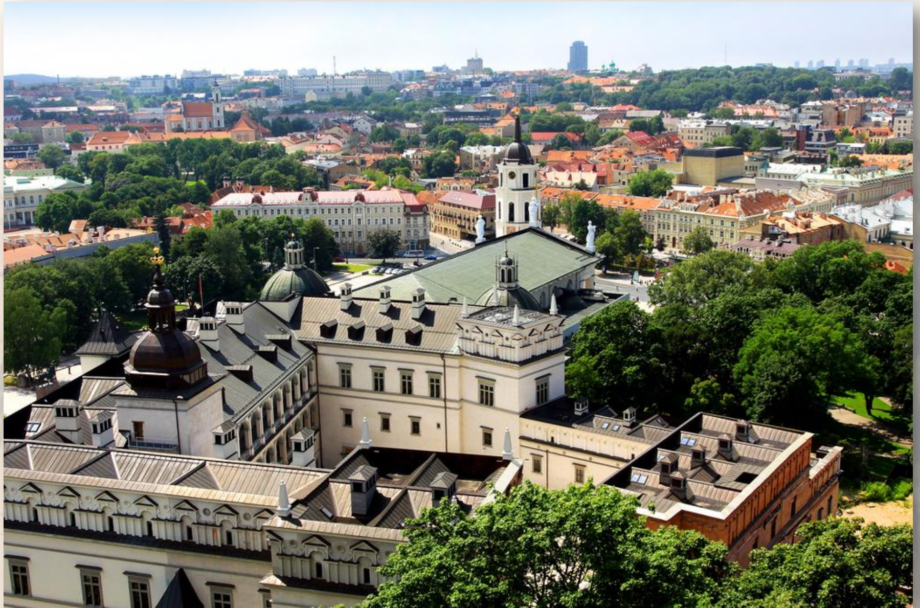
Vilnius Cathedral-Basilica, Palace of the Grand Dukes of Lithuania