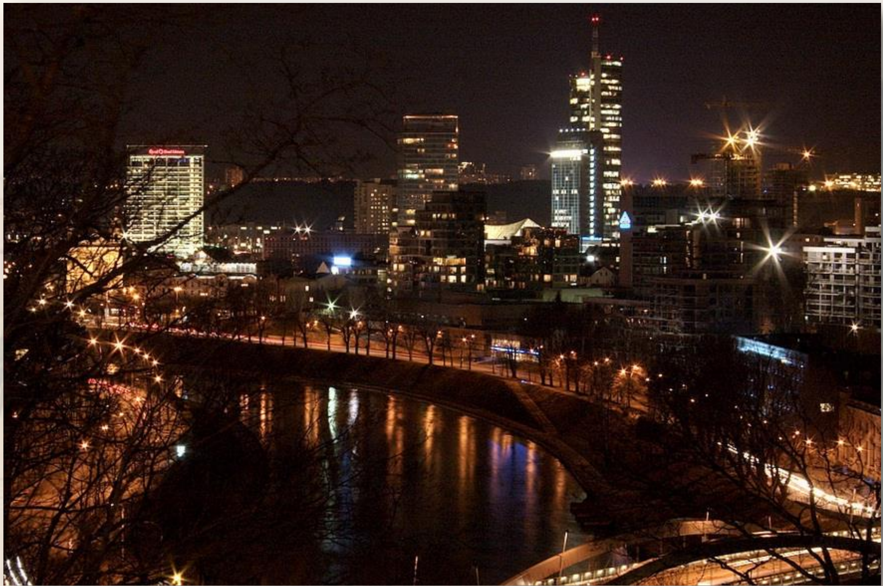
Vilnius at night