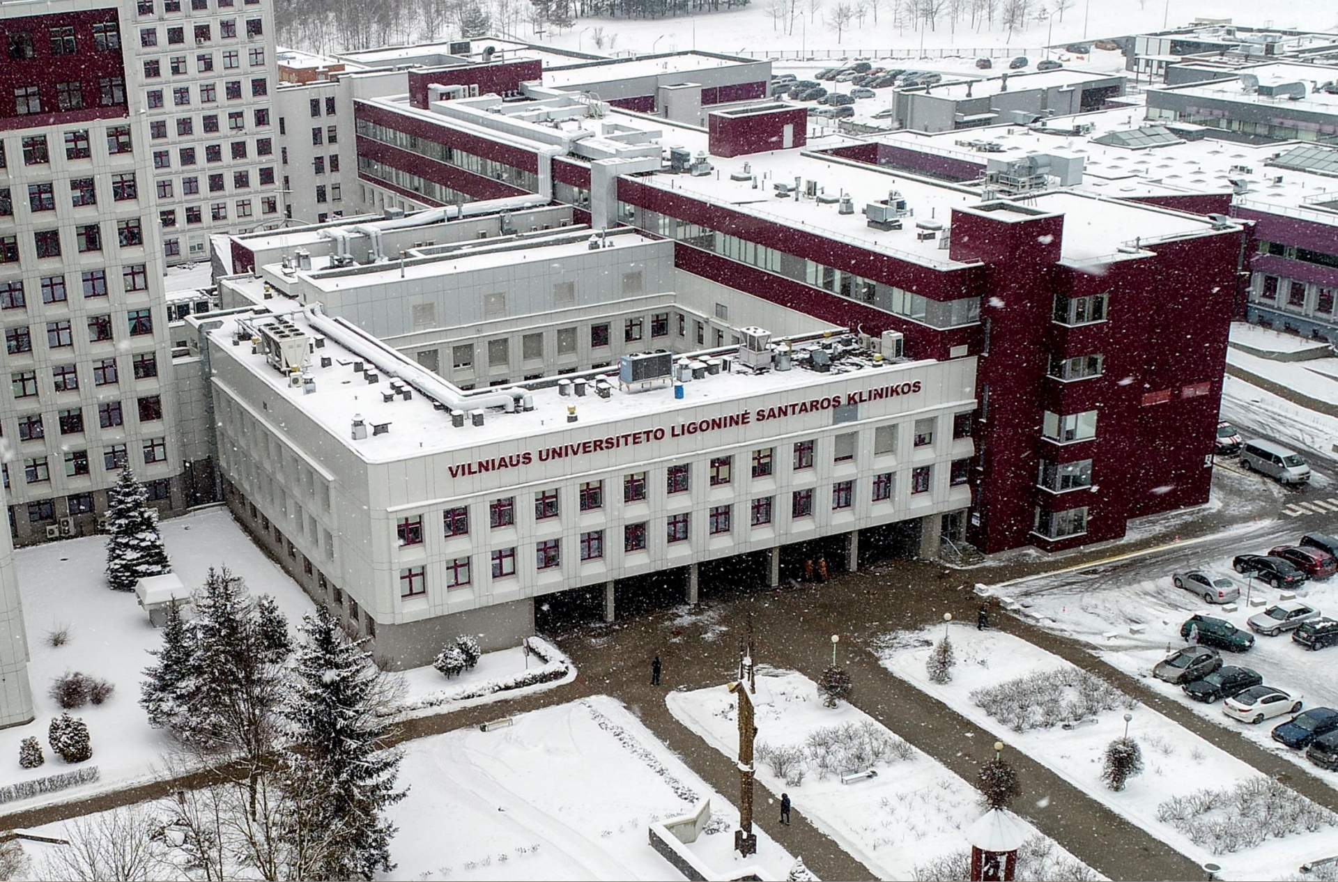
Vilnius University Hospital Santaros klinikos