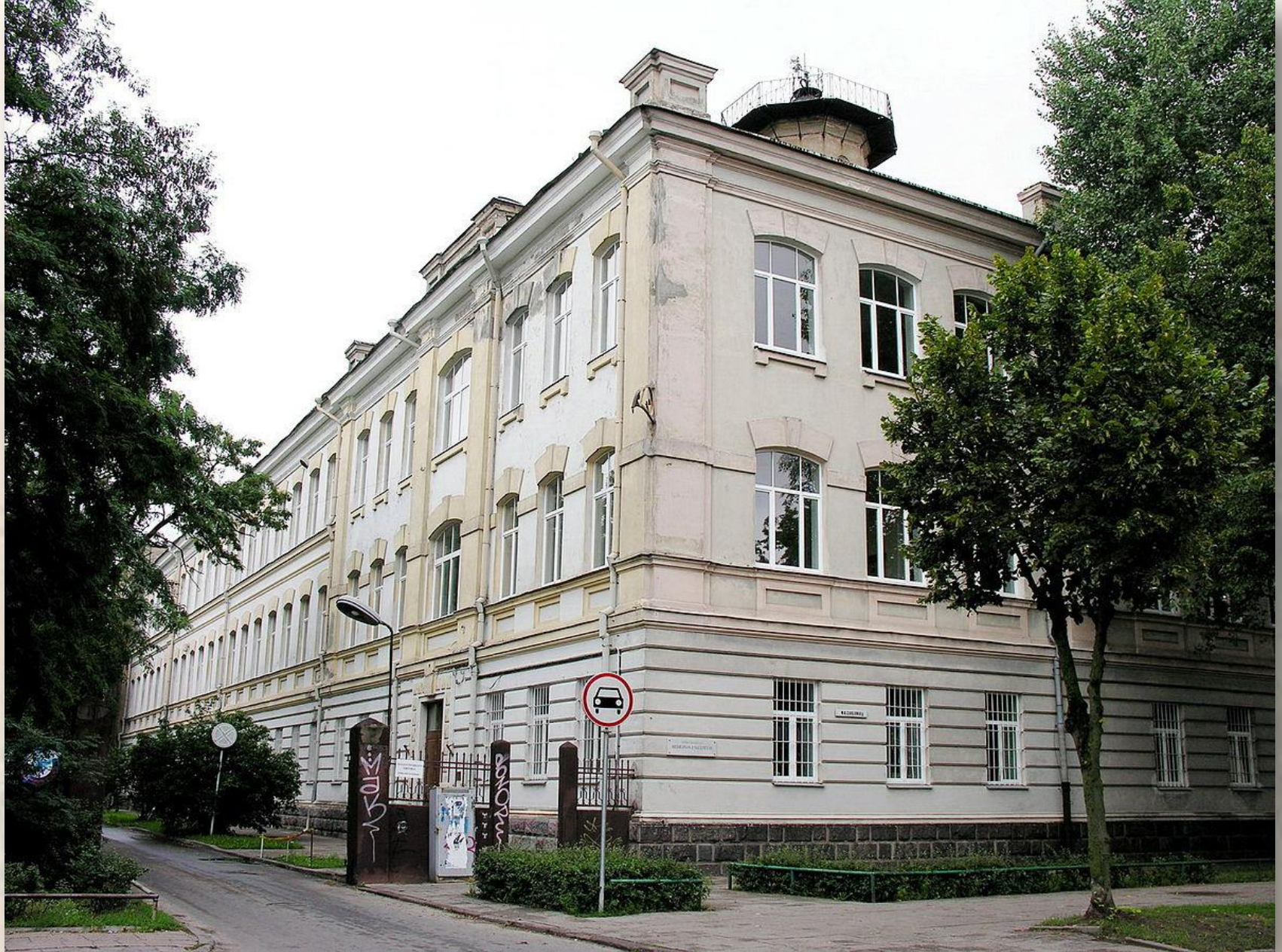
Faculty of Medicine