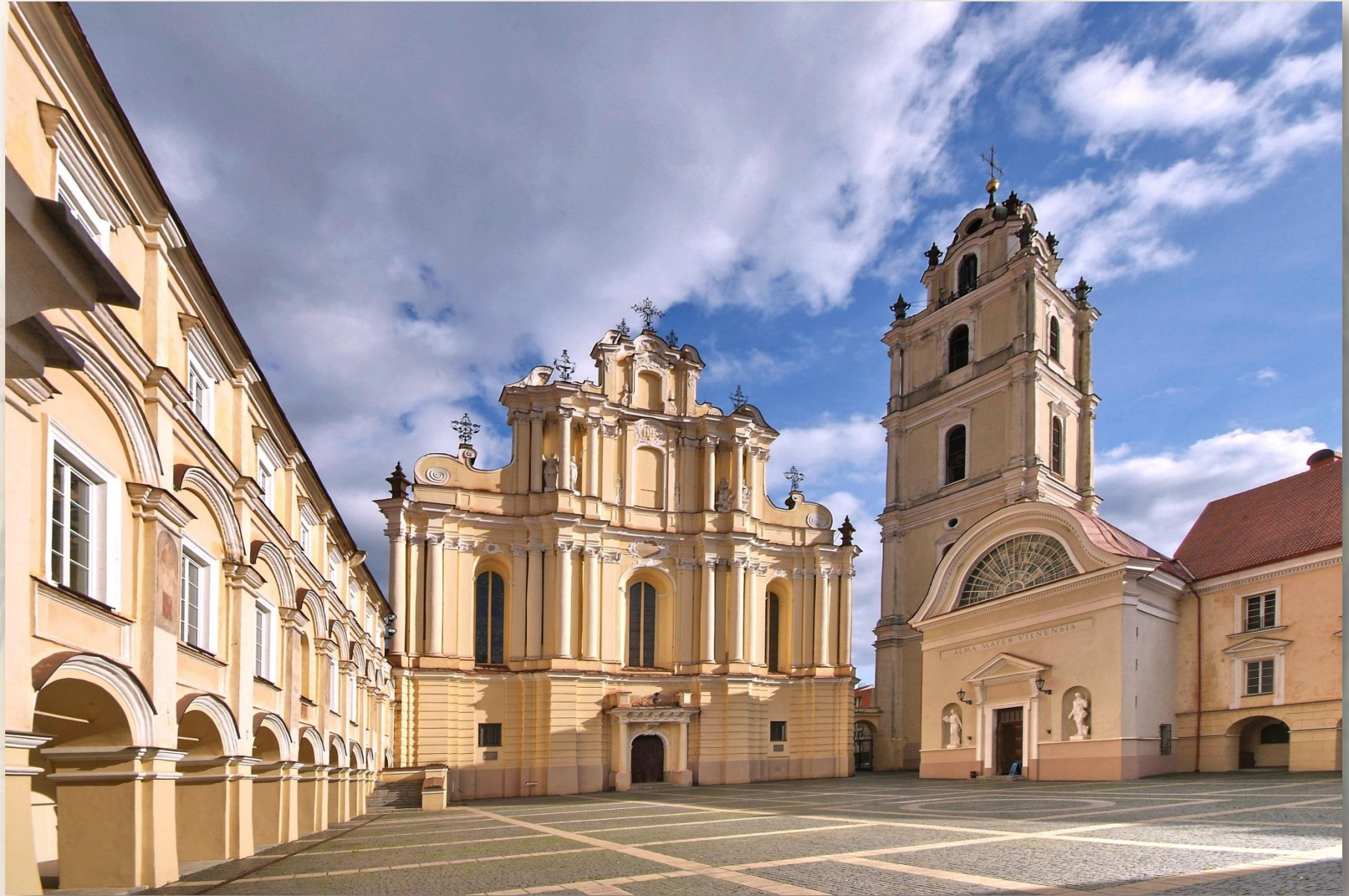
Church of the Sts. John in the Grand Courtyard of the University