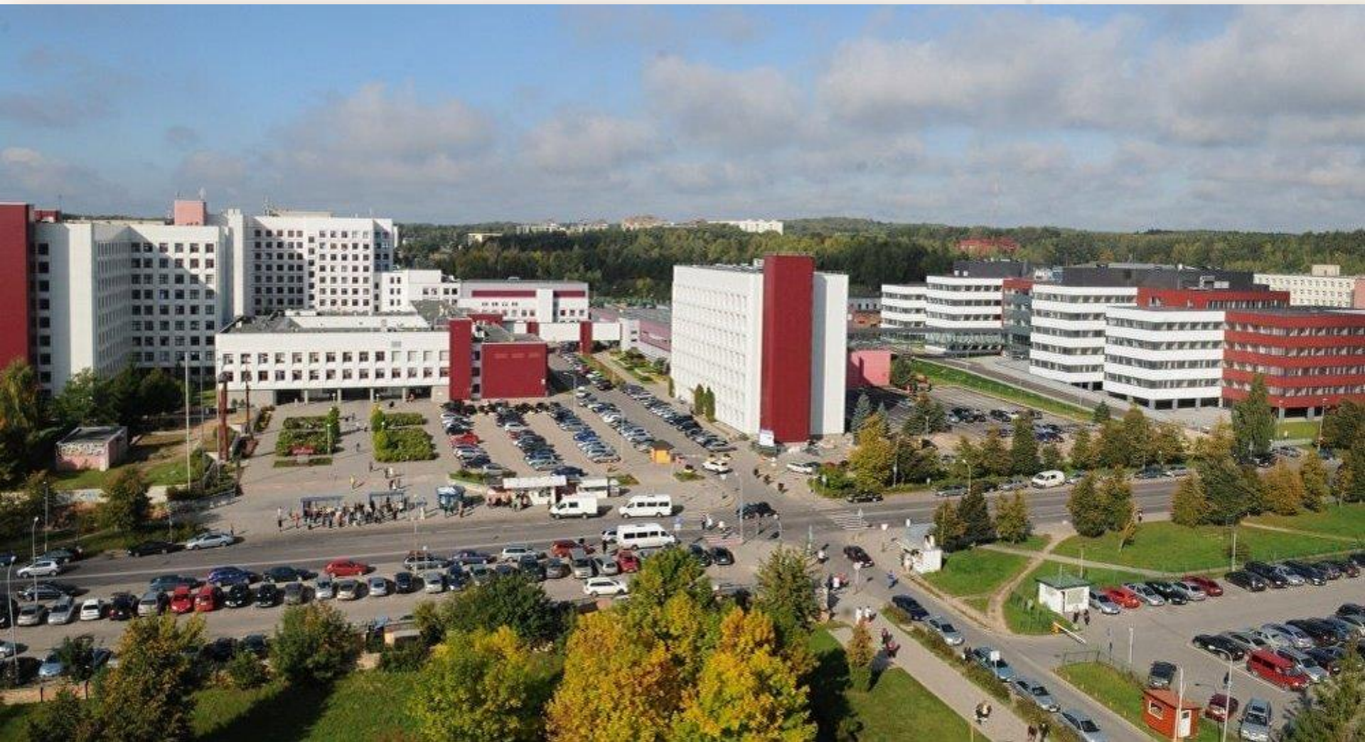
Vilnius University Hospital Santaros klinikos